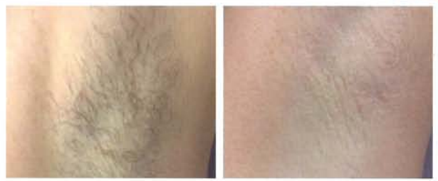
Forever BARE™ BBL® | 4 months post 3 treatments

Hair removal that is faster, safer, and more comfortable than traditional treatments