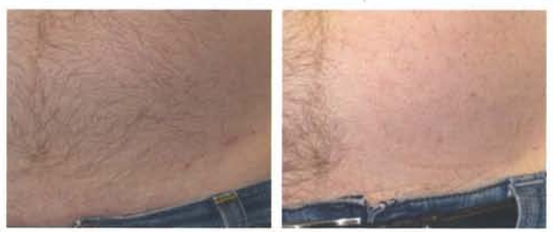
Forever BARE™ BBL® | 2 months post 3 treatments