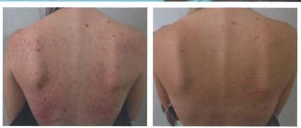
Forever Clear™ BBL® | 9 weeks post 2 treatments