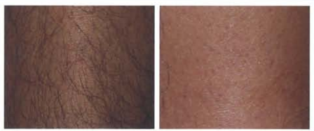
Forever BARE™ BBL® | 6 months post 3 treatments