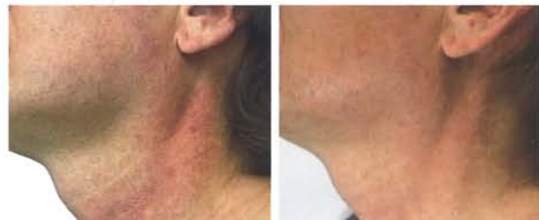
BBL® | 3 months post 3 treatments