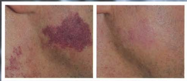
BBL ® | 4 months post 3 treatments