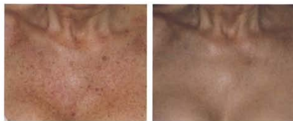
BBL® | 1 month post 2 treatments