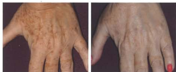
BBL® | 3 months post 2 treatments