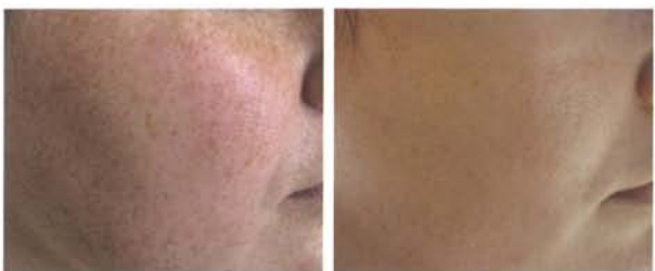
BBL® | 6 months post 1 treatment