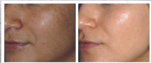
Forever Young® BBL® | 5 years of yearly routine BBL treatments (7 total) courtesy of Antonio Campo-Voegeli, MD, PhD

Patients love their results after one treatment, but for truly lasting results, Forever Young BBL should be incorporated into an ongoing treatment regimen.