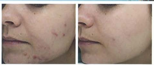
Forever Clear™ BBL® | 2 months post 3 treatments