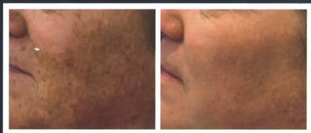
BBL ® | 1 month post 1 treatment

Light energy delivered by the BBL ® stimulates your skin cells to regenerate and restore your skin. BBL is best known for treating pigment and vascular conditions, acne, hair removal and the visible changes associated with aging skin.