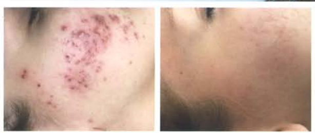
BBL® | 1 year post 8 treatments courtesy of The Skin Room