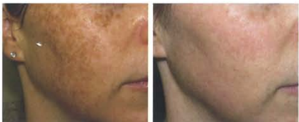
BBL® | 1 month post 1 treatment