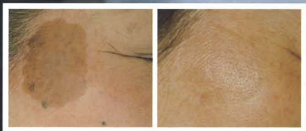
BBL ® | 8 months post 2 treatments