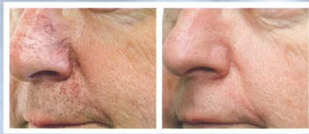
BBL ® | 2 months post 1 treatment